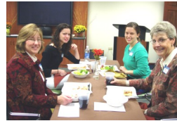
My presentation for Pizza Night: What Does It Mean to Be a Sister Today?